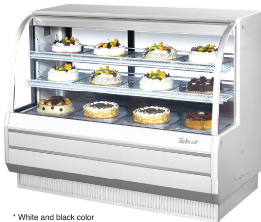
* White and black color come standard